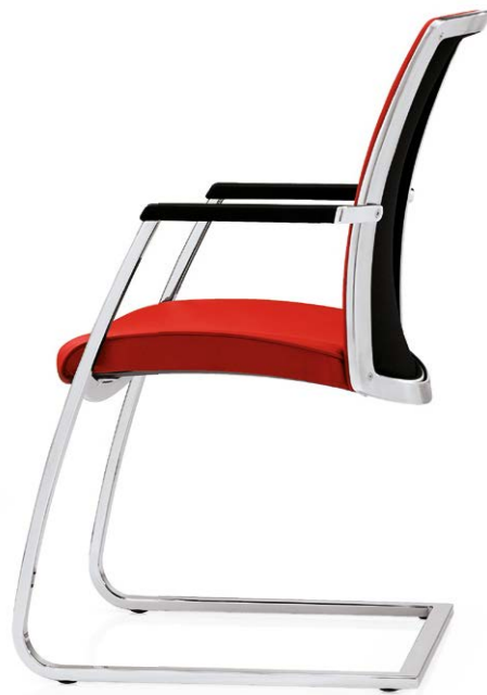
HW 16030 002 executive